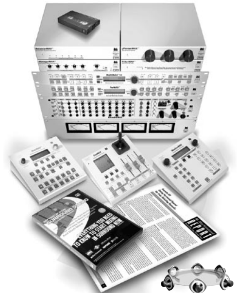
DVD and Report compliment our MAX surround solutions

To order your free report and receive your DVD discount offer, return the response card on the back of this newsletter, give us a call or fill out the request form on the web. Get the knowledge you need to successfully transition to surround sound, the format of the future.