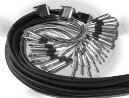
MAX Cables simplifies installation at a lower cost

We stock a wide variety of lengths with a DB-25 on one end and your choice of DB-25, XLR Male or Female, Metal 1/4" Phone TRS, Balanced TT, or RCA connectors on the other. Need custom termination? Just cut the DB-25 to DB-25 cable in half and wire the cut ends. Each channel is individually shielded and jacketed making it easy to wire up 8 single-channel connectors or a single multi-channel connector like an Elco. You can also wire the cut end directly into your patchbay.