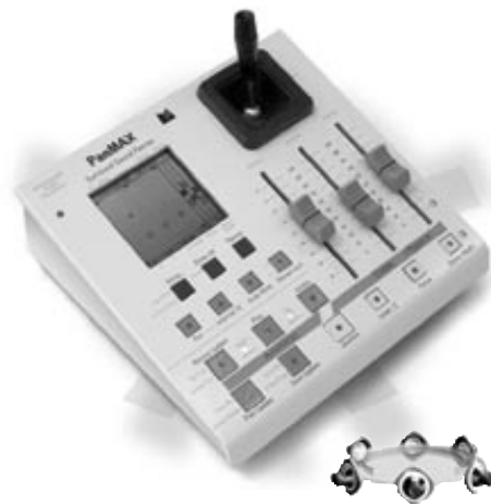
One PanMAX Remote can control up to 14 panners.

PanMAX also offers automated frame-accurate step recording of dynamic sound movements, interpolating between the reference points to produce smooth and continuous sound motion. The system provides user selection of various