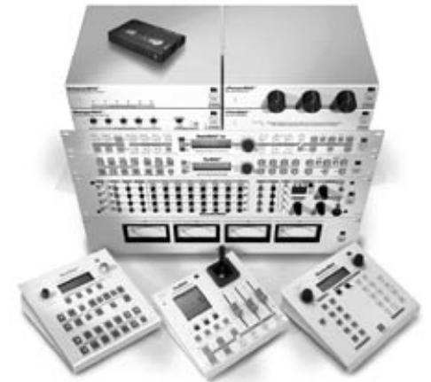
TMH Qualified products join the MAX line

CheckMAX Test Tapes are the easy to use setup tool featuring precise computer-generated signals for