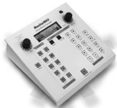
MonitorMAX Remote provides crucial monitoring and talkback features for any studio environment.