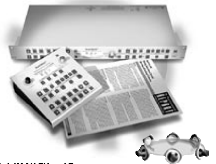
MultiMAX EX and Remote

Learn how MultiMAX EX and the entire MAX range of surround solutions products can help you maximize your investment in your existing equipment by adding the multichannel,